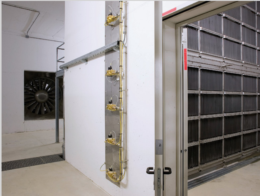
Ionizer with wash system