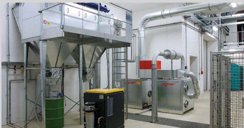
Technical room with complete equipment for cleaning, high voltage system and control system