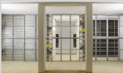
By-Pass with automatic dampers