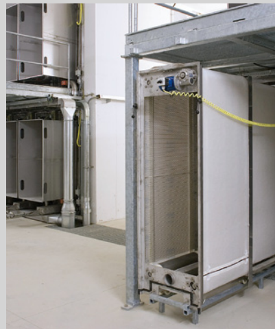
ECCO with dry cleaning system of collector