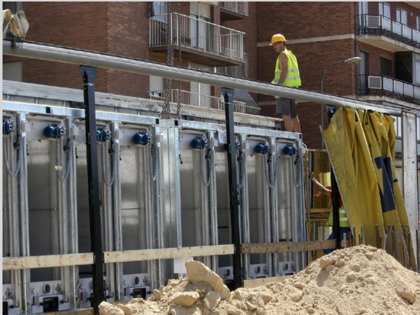
ECCO installation - Avenida Portugal