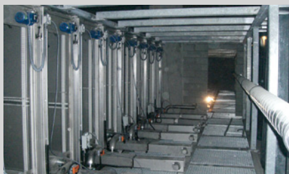
Automatic dampers for sectional cleaning