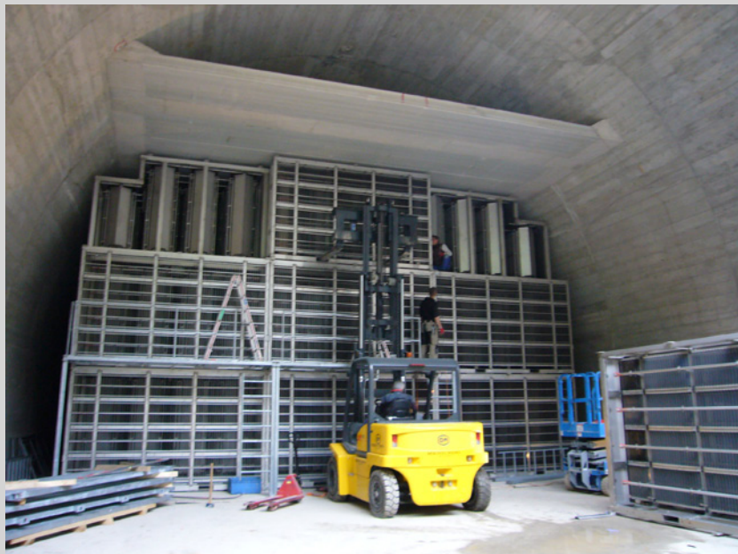
Installation of ECCO filter