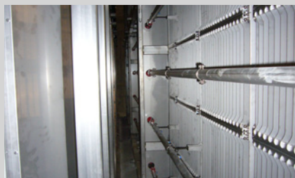
Wash tubes for cleaning of ionizer